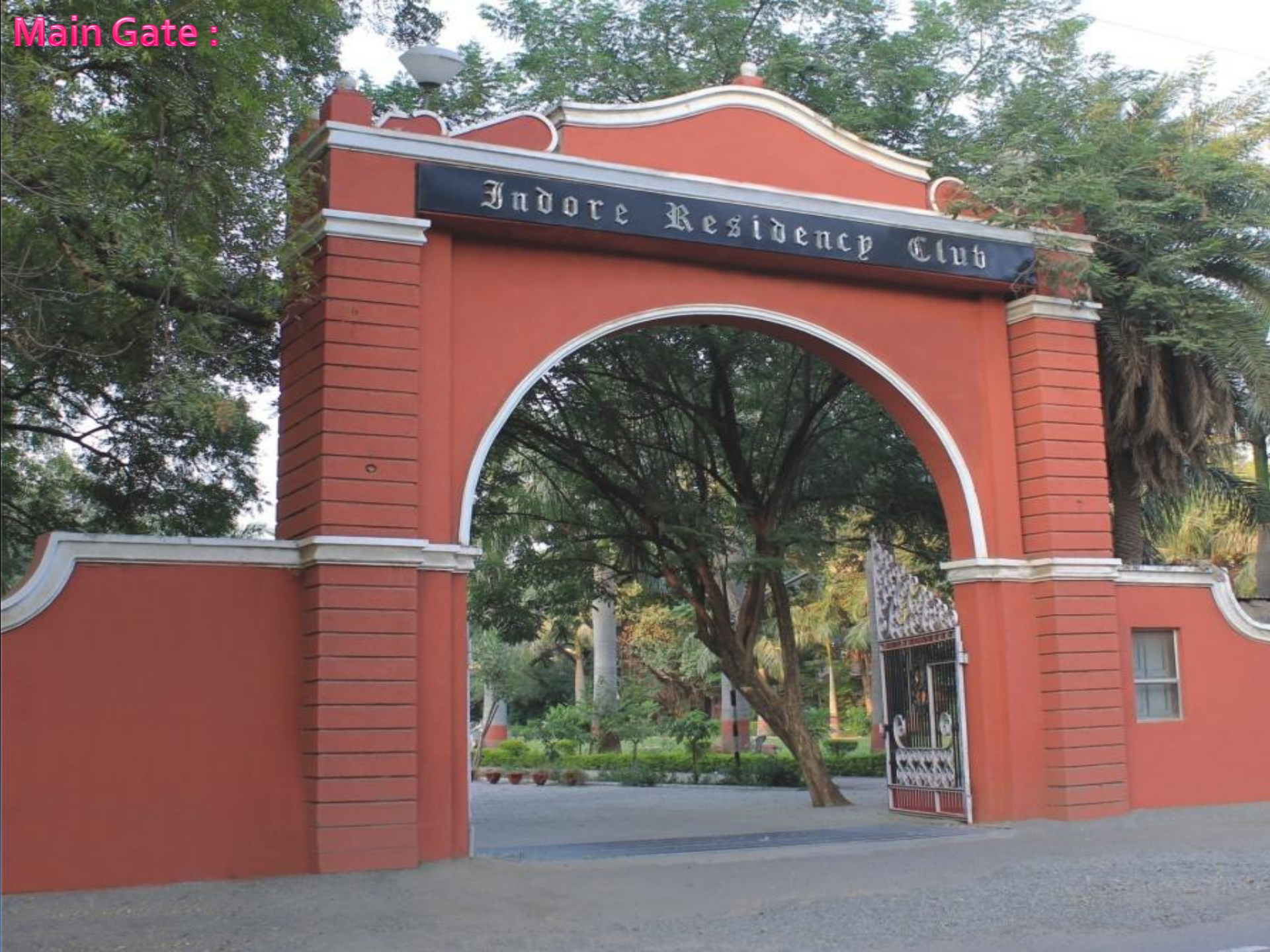
Main Gate :