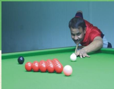
Within our walls • Indoor joy